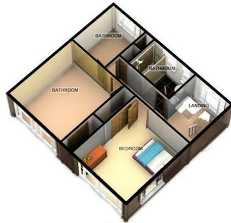
1ST FLOOR APPROX. FLOOR AREA 620 SQ.FT. (57.6 SQ.M.)