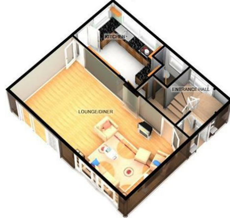
GROUND FLOOR APPROX. FLOOR AREA 618 SQ.FT. (57.4 SQ.M.)